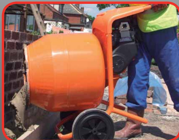
Balanced Design Ensures Control When Tipping