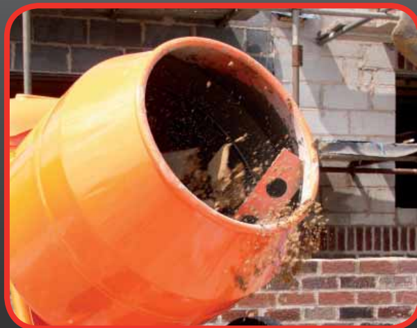
Rapid Mix Drum Paddles