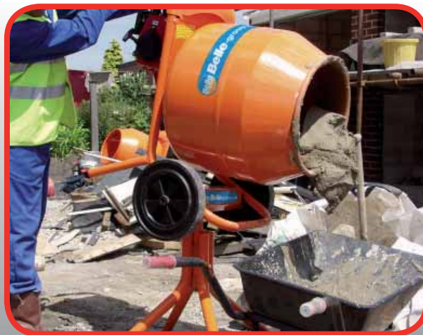
Barrow Height Tipping